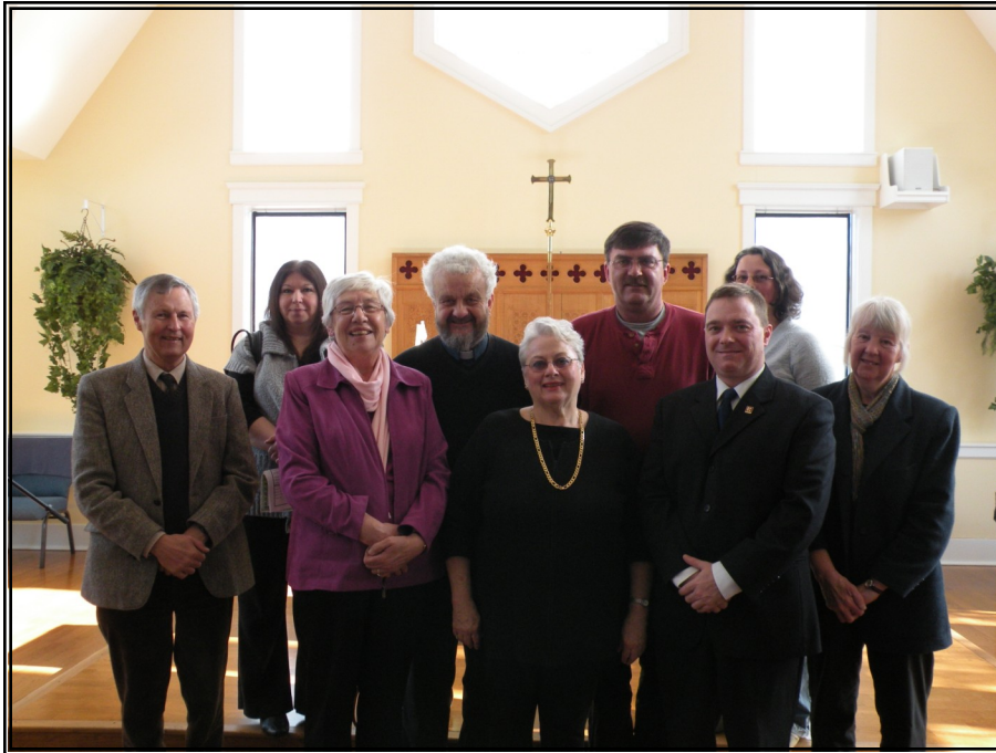
Our combined Parish Council, those leaving and those coming in for the year 2011